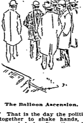
The Balloon Ascension.

Special to The Inquirer. MOUNT HOLLY, N. J., Oct. 10.—The Mount Holly Fair, like all the other Jersey fairs, has its "Big Thurs-